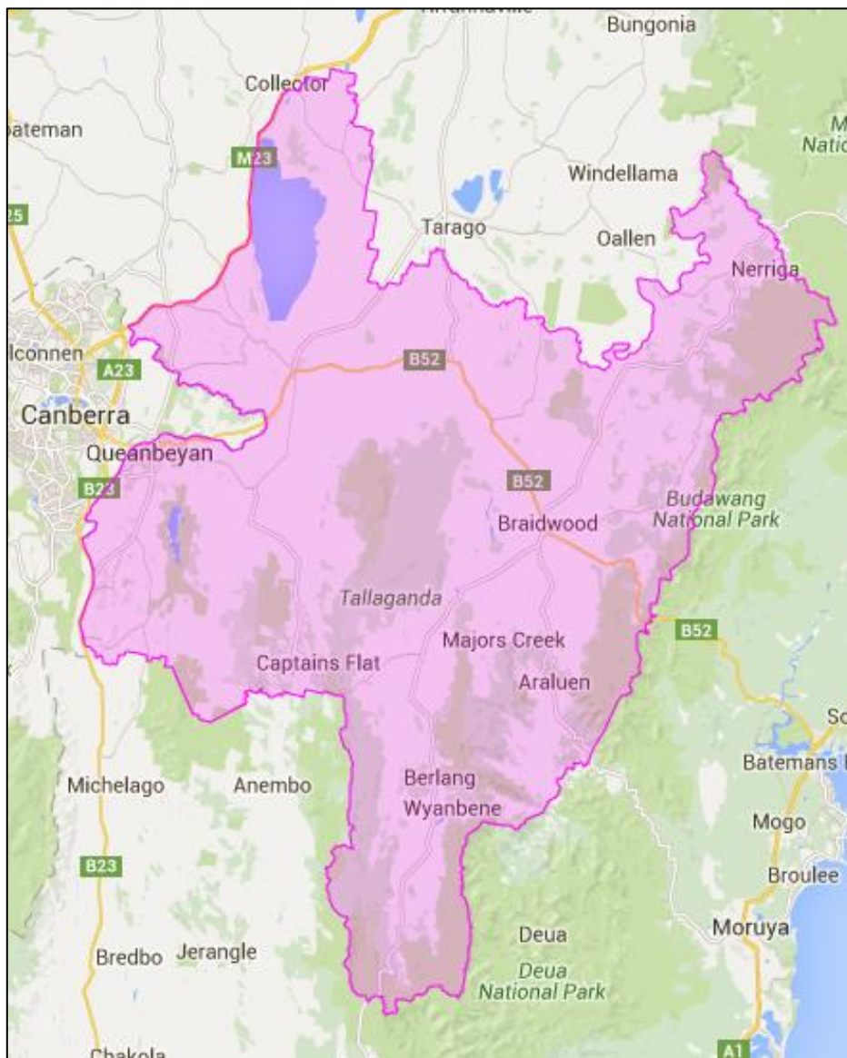
Figure 1: Map of Queanbeyan-Palerang Regional Council local government area

Council has previously received a Gateway determination for this matter (PP_2018_QPREG_002_00 dated 23 November 2018) however Council is seeking a revised Gateway determination in order to address a number of additional planning matters precluded by the current determination when issued.